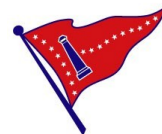
Ida Lewis Yacht Club